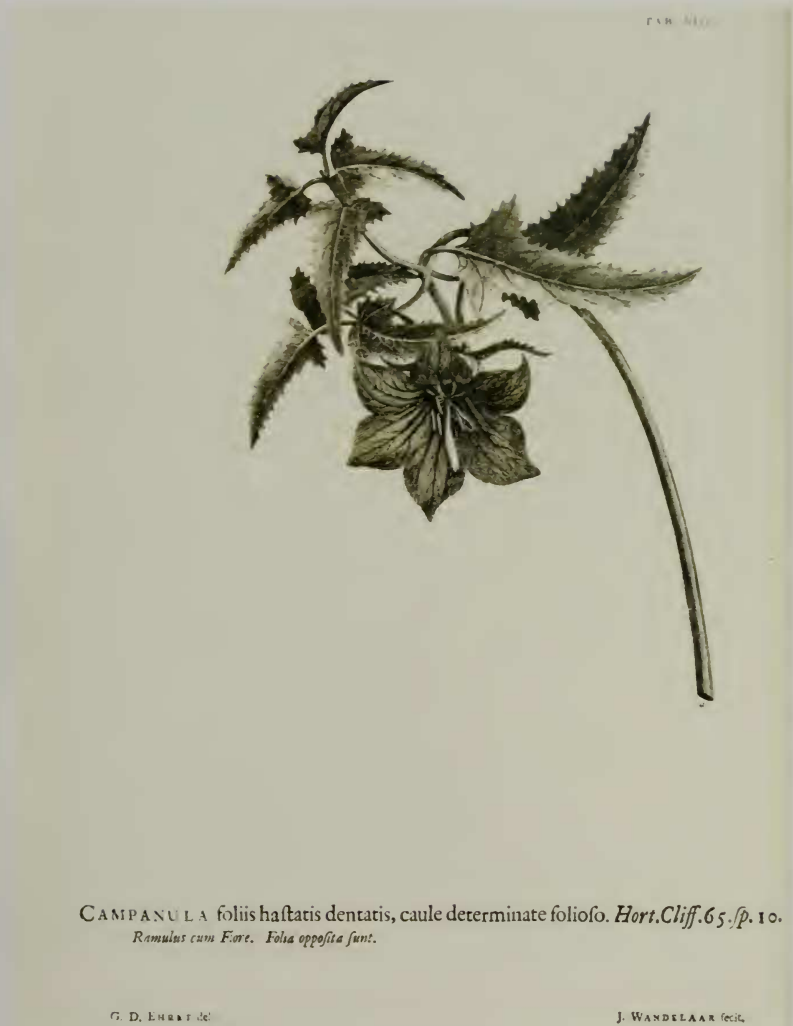
Figure 3.- Copperplate engraving of Canarina [as Campanula ] canariensis made by Georg Dionysius Ehret and engraved by Jan Wandelaar. Depicted in Hortus Cliffortianus (LINNAEUS [41]).

in the tropics. These gardens were part of the state symbolism, a statement of increasing international power, and a focal point for the developing sciences of natural history and taxonomy (SCHAMA [75]; SCOTT & HEWETT [77]). Many of the species first given binomial names by Linnaeus in Species Plantarum (including 21 Macaronesian plants) were based on the living collections that he studied while at the Hartekamp. As a result of his near three-year tenure (1735-1737) in this botanic garden, LINNAEUS [41] produced a remarkable 502 page catalogue with descriptions and engravings of its living collections which has been considered as one his masterpieces (Figure 2) (STEARNS [82]). This work featured a plate of the Canarian Island endemic Canarina [as Campanula ] canariensis made by Georg Dionysius Ehret (1707-1770) and engraved by Jan Wandelaar (1690-1759) (Figure 3).